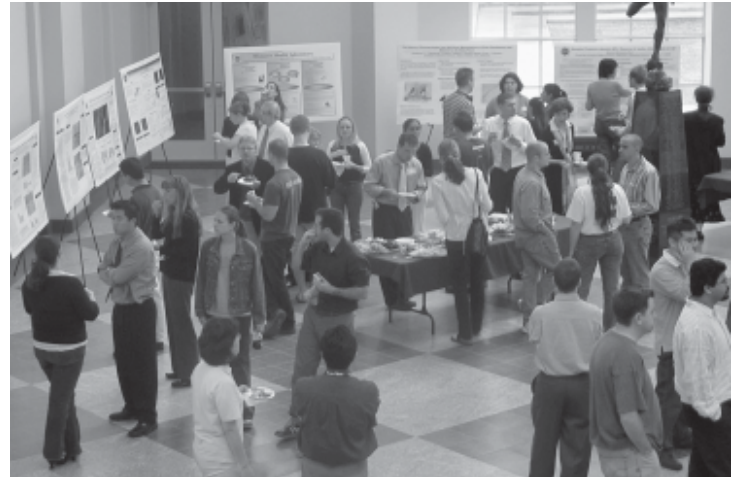
MORE THAN 30 POSTERS SHOWCASED FACULTY RESEARCH AT THE FIRST ANNUAL RESEARCH FAIR. MEDICAL STUDENTS HAVE THE OPPORTUNITY TO JOIN FACULTY IN THEIR RESEARCH PROJECTS.

Aman and fellow researchers collected data by phoning parents of diabetic children to learn everything the child had done – from