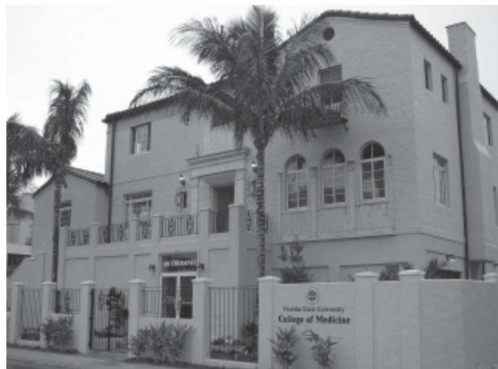
THE FSU REGIONAL MEDICAL SCHOOL CAMPUS – SARASOTA IS HOUSED IN THE HISTORIC WEISSGERBER/FAMIGLIO HOUSE.

At FSU's other regional medical school campuses, between 150 and 200 local