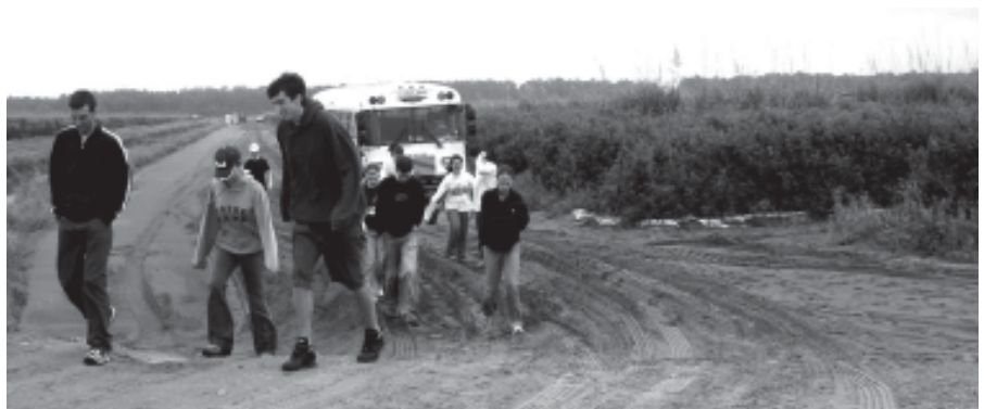
WHILE IN IMMOKALEE, MEDICAL STUDENTS TOURED TOMATO FARMS AND PACKAGING FACILITIES TO LEARN WHAT MIGRANT FARMWORKERS TYPICALLY EXPERIENCE IN THE WORKPLACE.