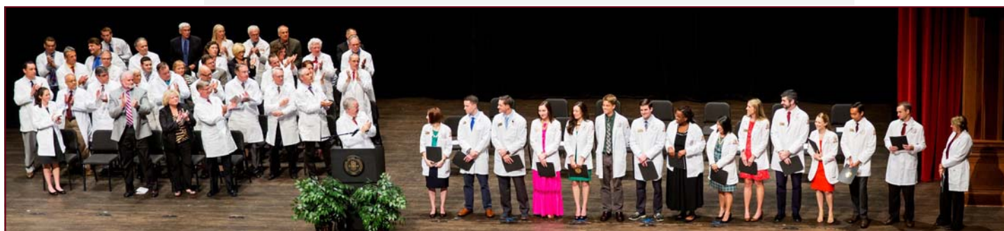
The new members of the Gold Humanism Honor Society at the ceremony in Tallahassee

The Gold Humanism Honor Society An initiative of the Arnold P. Gold Foundation