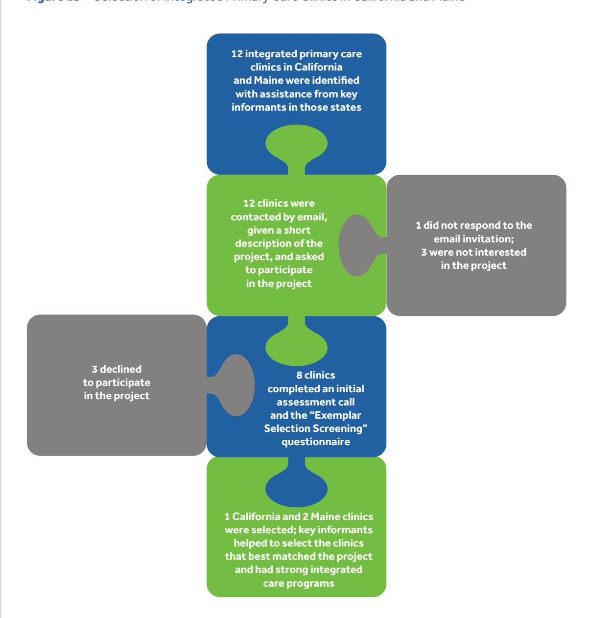
Figure 1b Selection of Integrated Primary Care Clinics in California and Maine

Table of Contents Background Methodology Findings Conclusion Professional Practices