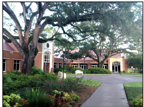
FSU Alumni Center

(Free parking will be available at Alumni Center)