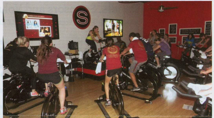
Pedaling for Parkinson's cycling teams ride for the cause at Sweat Therapy