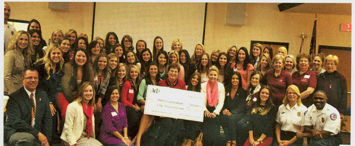
Both active members and alumnae of the FSU Gamma Phi Chapter of Alpha Phi joined in celebrating the Heart to Heart grant's presentation to the TMH Foundation