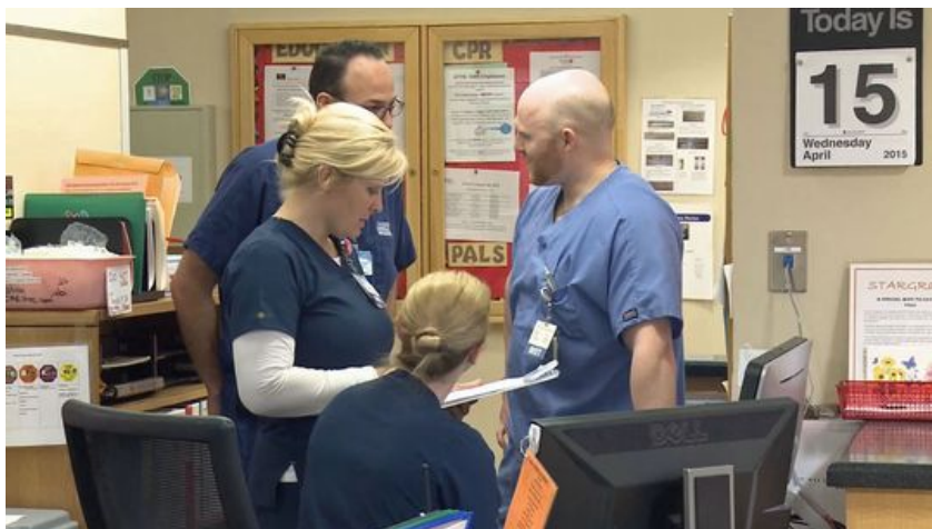
Sarasota Memorial, FSU prep for doctor shortage

Population growth studies show Sarasota and Manatee County combined will see an average of 11,000 new residents each year through 2020.