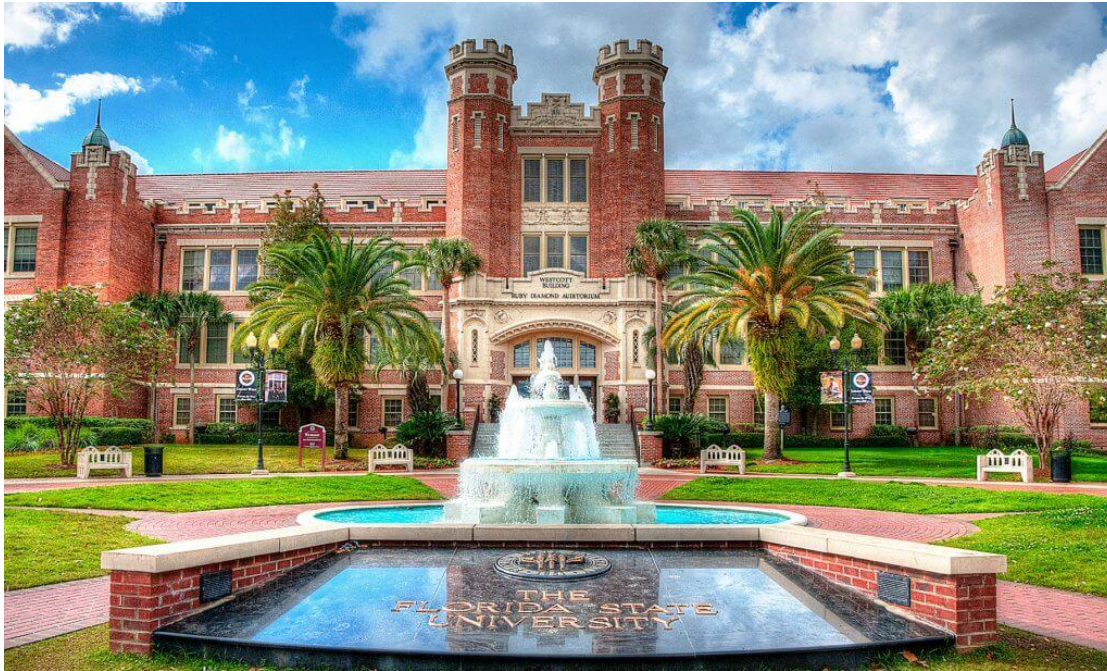
Florida State University

The Florida State University College of Medicine, located in Tallahassee, Florida, is one of sixteen colleges composing the Florida State University. The College is an accredited medical school.