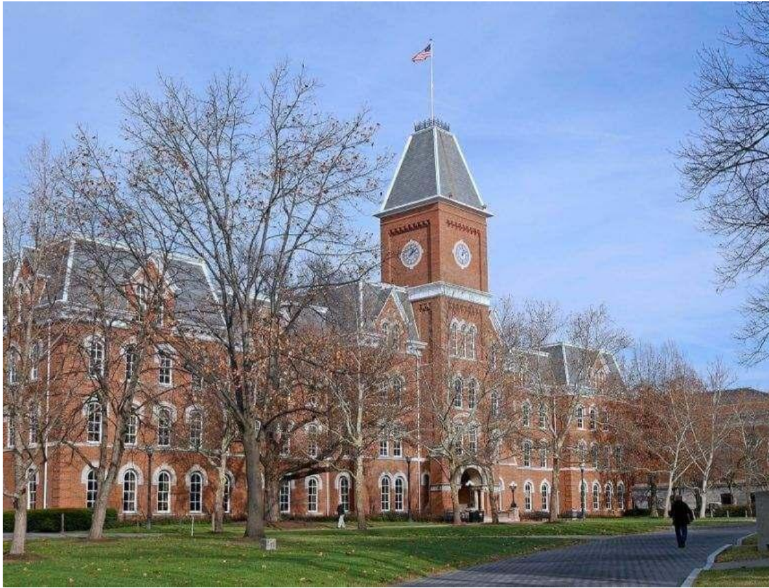
Ohio State University

The Ohio State University College of Medicine is the medical school at The Ohio State University and is located in Columbus, Ohio. Its tuition is full-time: $30,690 (in-state) and full-time: $41,798 (out-of-state).