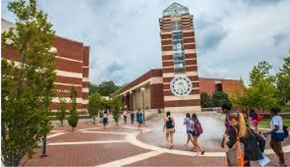
East Carolina University (Brody) (NC)

The Brody School of Medicine is the medical school at East Carolina University, located in Greenville, North Carolina, United States. Its tuition is full-time: $20,252 (in-state).