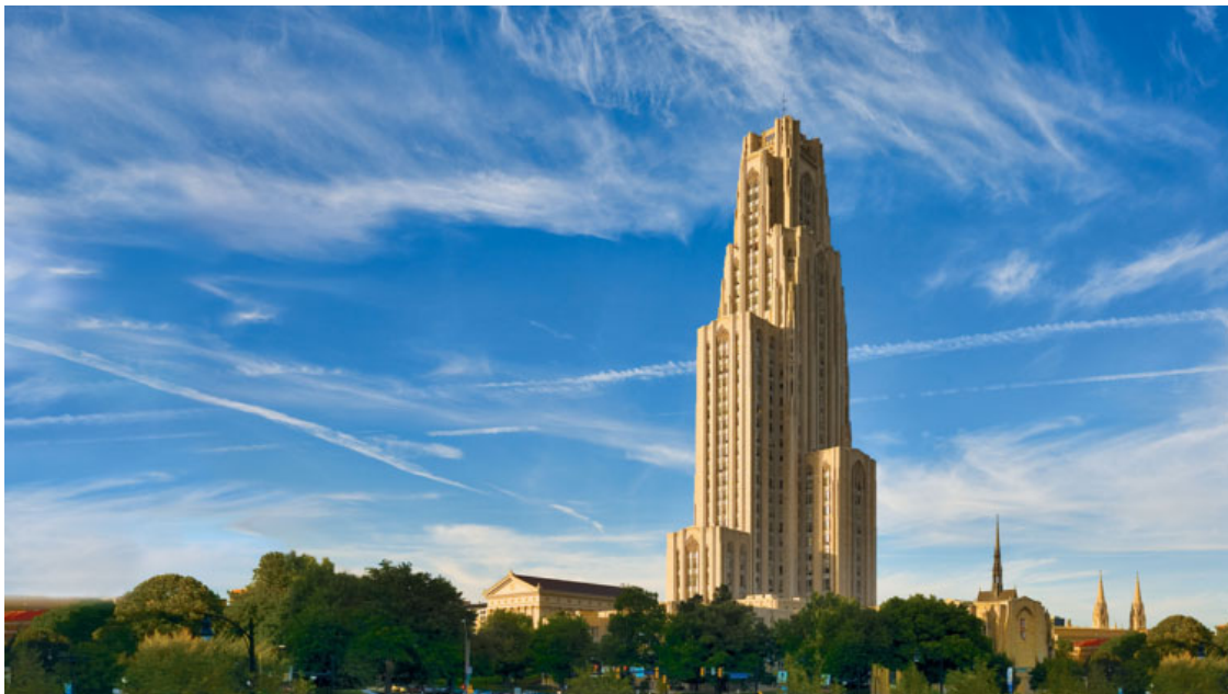
University of Pittsburgh

The University of Pittsburgh School of Medicine is a medical school located in Pittsburgh, Pennsylvania. The School of Medicine, also known as Pitt Med.