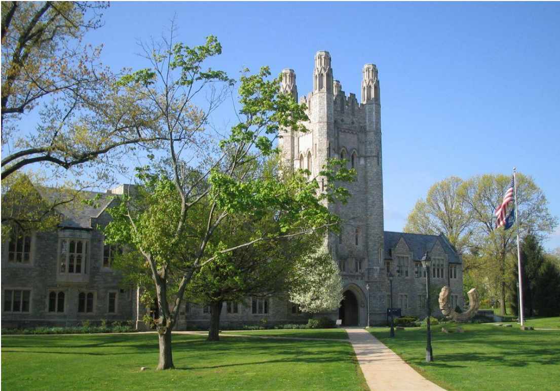
University of Connecticut

The University of Connecticut School of Medicine is a medical school located in Farmington, Connecticut. Its tuition is full-time: $38,585 (in-state) and full-time: $72,665 (out-of-state).