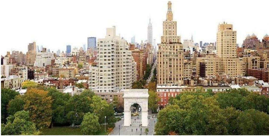
New York University

The New York University Grossman School of Medicine is the medical school of New York University. University Medical College, the NYU School of Medicine is one of the foremost medical schools in the United States,