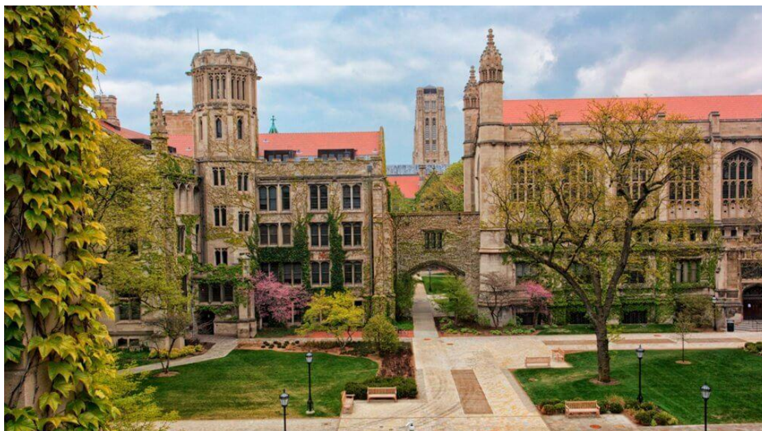
University of Chicago

The Pritzker School of Medicine is the M.D.-granting unit of the Biological Sciences Division of the University of Chicago. Its tuition is full-time: $56,550.