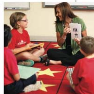
Florida Southern College is home to The Roberts Academy, a transitional school for children with dyslexia.