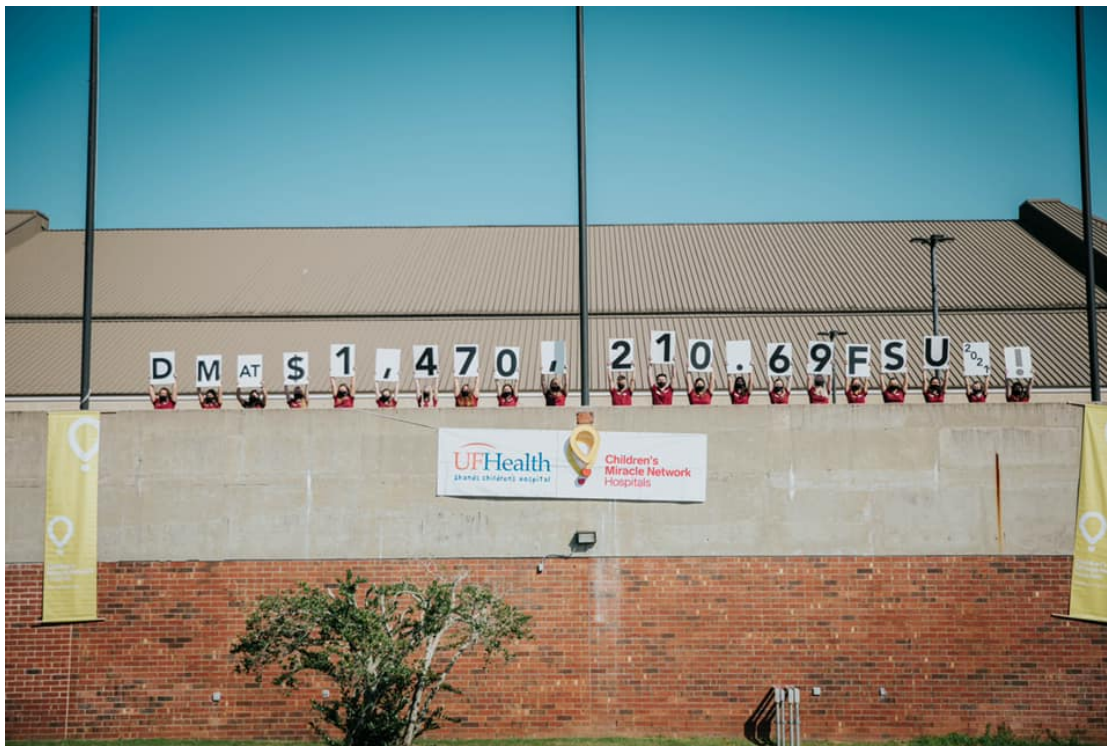
Dance Marathon at FSU raised more than $1.47 million during its first-ever hybrid event March 5-7.

EVENT%2F&TEXT=DANCE+MARATHON+AT+FLORIDA+STATE+UNIVERSITY+RAISES+%241.47M+DURING+FIRST-EVER+HYBRID+EVENT:%20HTTPS%3A%2F%2FNEWS.FSU.EDU%2FNEWS%2F2021%2F03%2F08%2FDANCE-MARATHON-AT-FLORIDA-STATE-UNIVERSITY-RAISES-1-47M-DURING-FIRST-EVER-HYBRID-EVENT%2F)