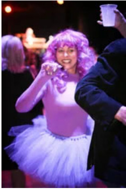
The Purple Craze party on April 27 raises money for the Alzheimer's Project.