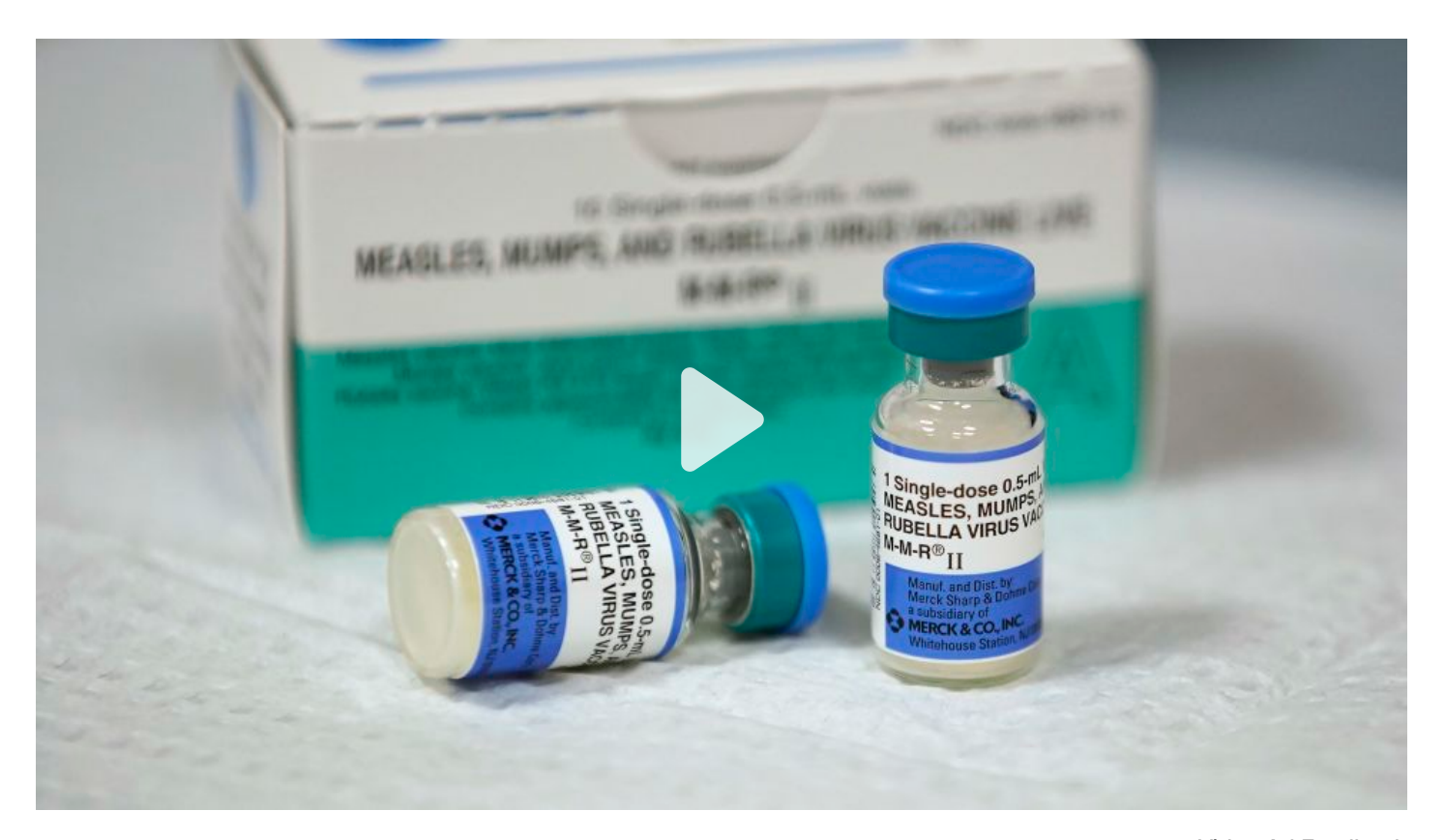
Video Ad Feedback

② 4 minute read · Updated 5:41 PM EST, Fri February 23, 2024